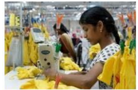
Women workers are paid minimum wages in a garment factory