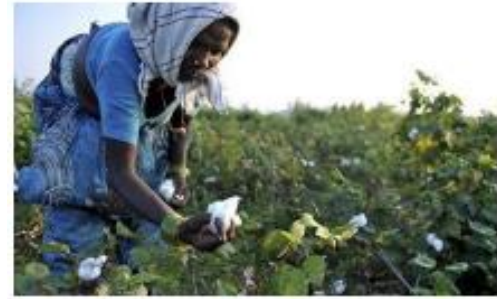
A cotton farmer

The life of a cotton farmer is not easy. Many farmers who grow cotton have small farms and have to work hard to harvest the cotton crop. After harvesting the cotton, the farmers generally sell the cotton to the nearby traders. Some traders also provide loans to the farmers at very high interest rates. Also, while providing the loans, they sometimes put forth the condition before the farmers that they would sell their cotton produce only to them. The farmers are thus forced to sell their cotton to the same trader, who gives them a minimum price for their produce. This results in the exploitation and poverty of the cotton farmers.