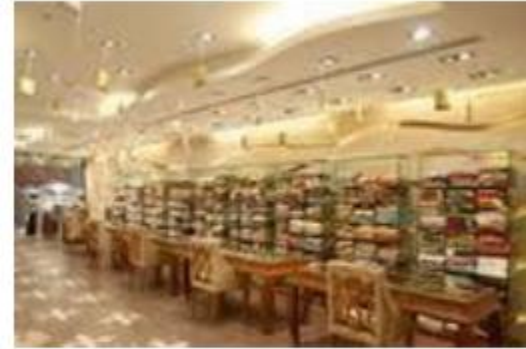
Garment showrooms earn the maximum profits in the markets